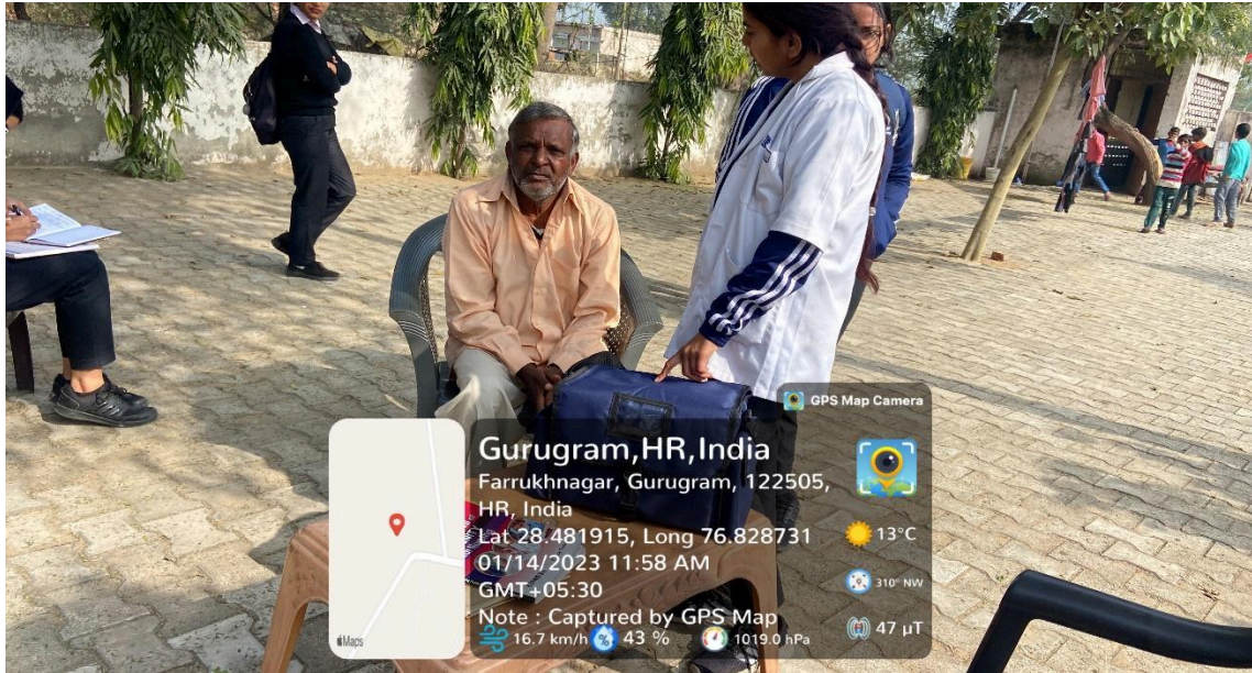
Monitoring B.P and RBS during the camp