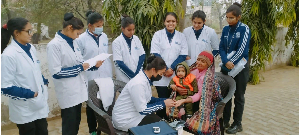
Students Monitoring B.P